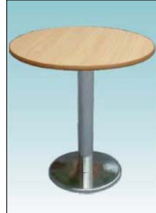
Round Table Dia H 70cm 75cm