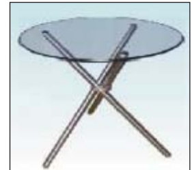
Round Table (Glass top) Dia H 90cm 75cm