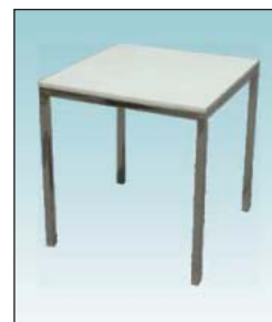
Square Table W H D 70cm 70cm 70cm