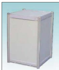
Podium W H D 50cm 70cm 50cm