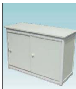
Lockable Counter W H L 40cm 70cm 90cm