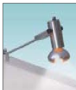
Arm Spot Light