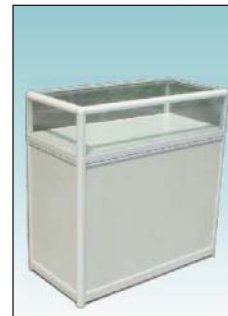
Glass Counter W H D 100cm 100cm 50cm