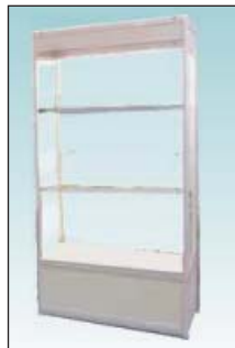
Glass Show Case W H D 100cm 200cm 50cm