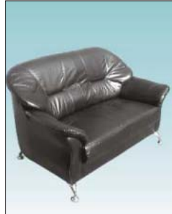
VIP Sofa Double