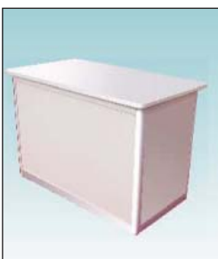
Counter Table W H L 50cm 75cm 100cm