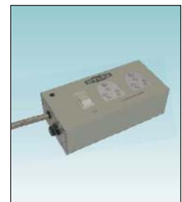
Socket Out Let