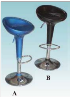
Bar Stool (Adjustable) H - 50cm