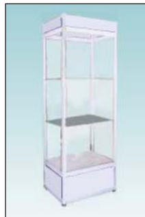
Show Case (Slim) W H D 50cm 200cm 50cm